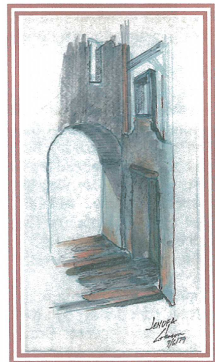
Concept sketch of a setting for the opera Jenufa