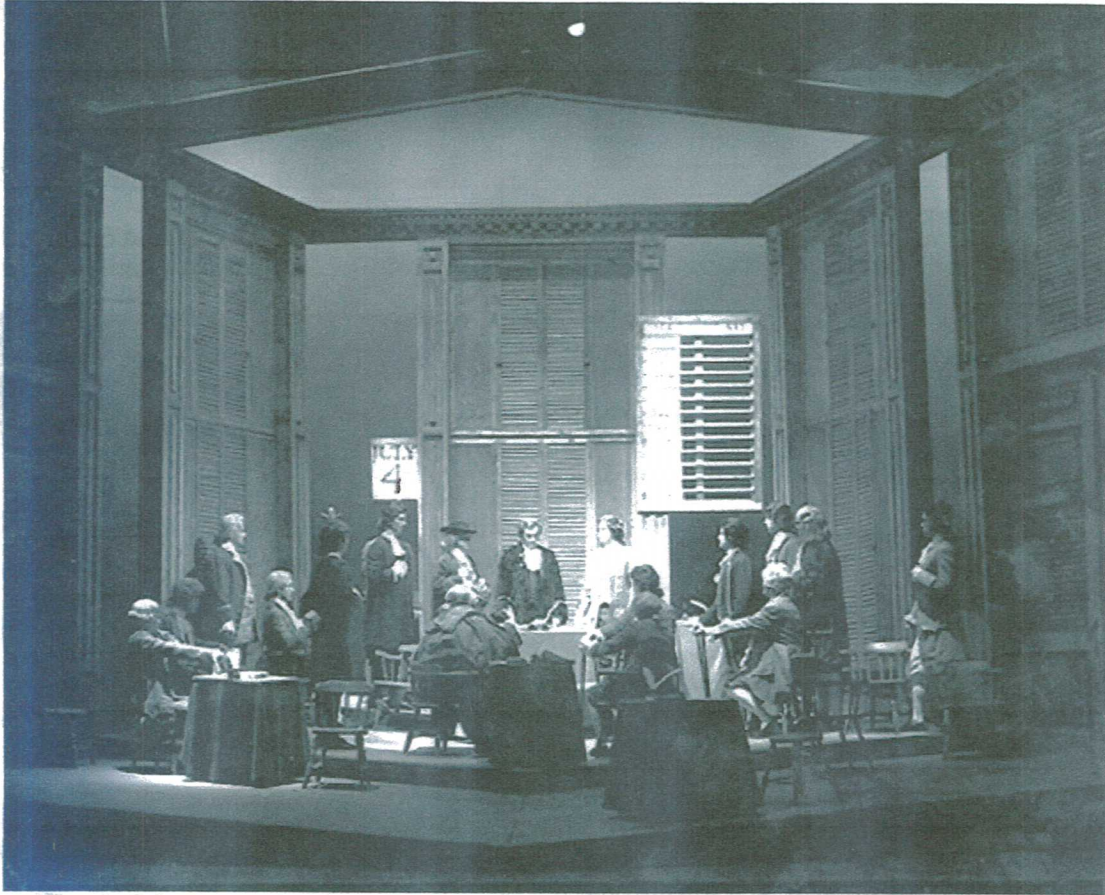
Setting for 1776