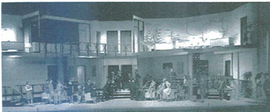
Setting for How to Succeed in Business Without Really Trying - DeJong Concert Hall