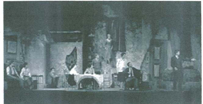
Diary of Anne Frank Smith Auditorium